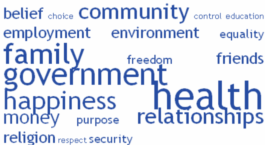
Figure 1 Commonly used words in the national well-being debate