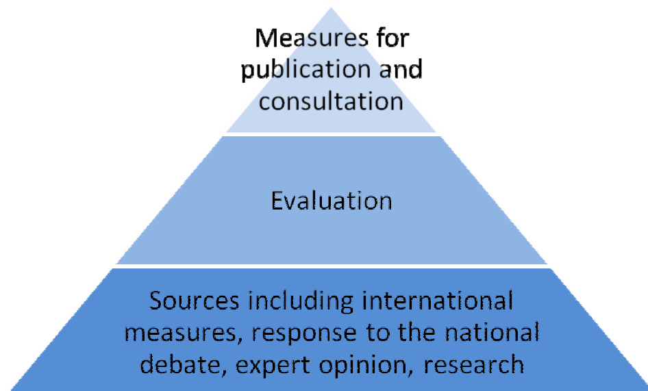
Figure 3 Developing a set of measures of national well-being

'The conditions that other people, who may not have had the life opportunities that I have, live in and how they are treated by society'