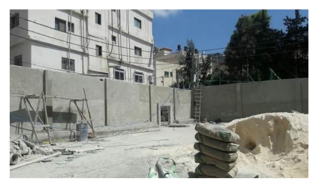
Rehabilitation work being conducted in the multisport pitch in Jalazone camp