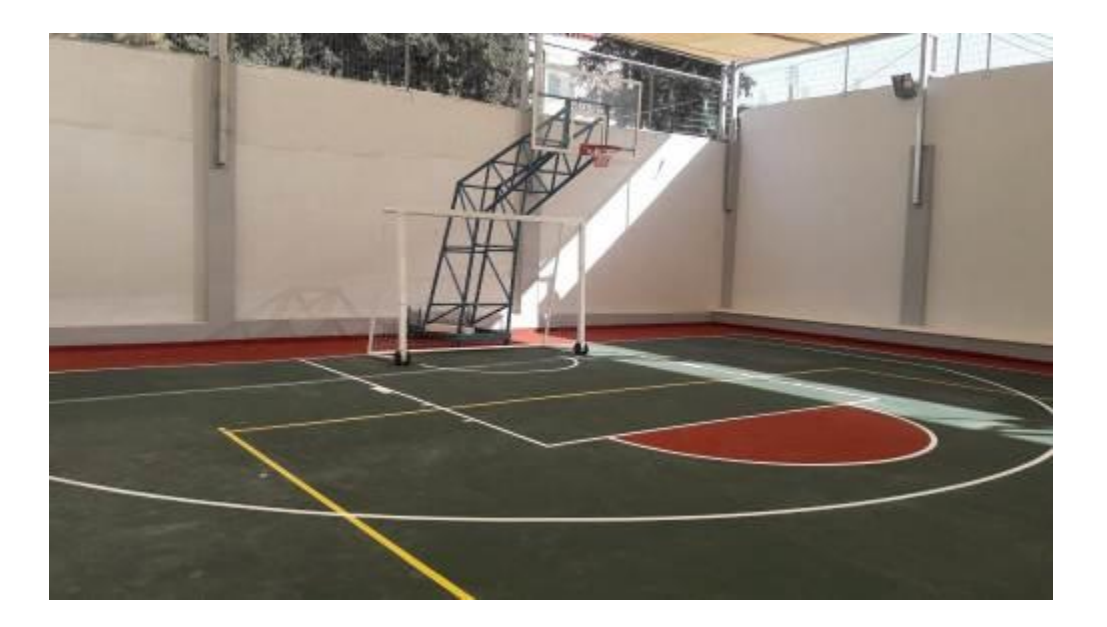
Sports pitch in Jalazone camp when finalized.